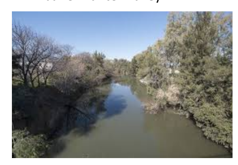
Stay up to date with upcoming consultation events here.